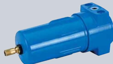
Micro fine filter