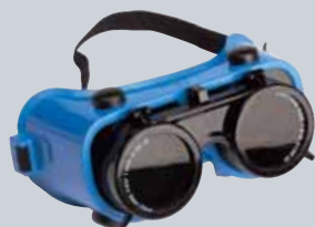
Lift up welder's goggles P